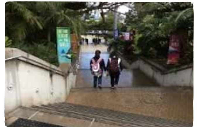
Down the steps