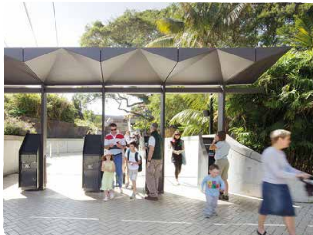
Around the side and down the path