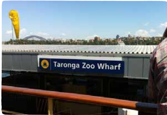
Taronga Zoo Wharf

We can go home by ferry, or catch a bus from the bottom of the zoo, or get on the Sky Safari and ride up to the top of the zoo to get our car.