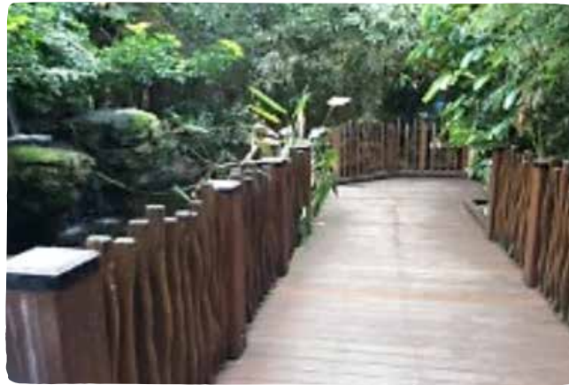
Around the side and down the path