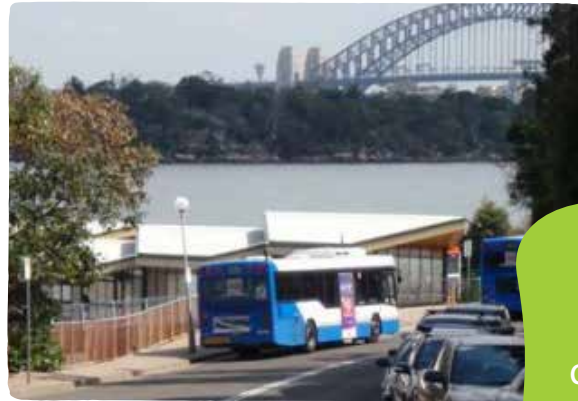
Catch a bus